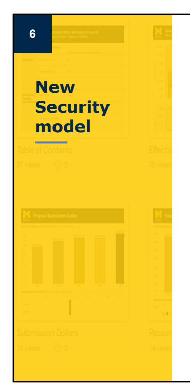
Tableau permissions - AFTER