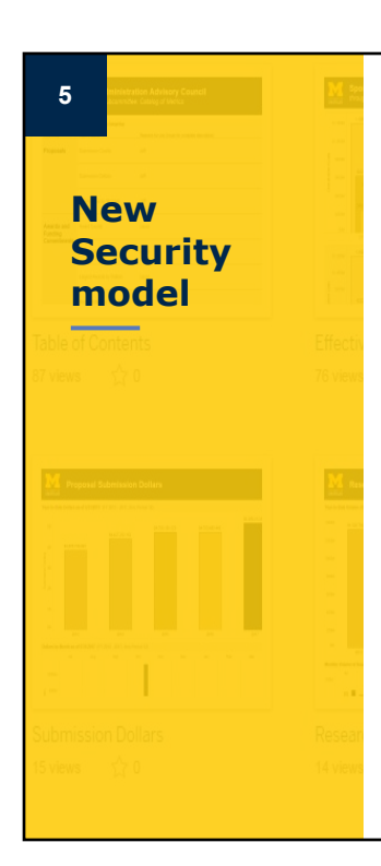
Tableau permissions - BEFORE